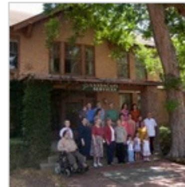
Evelyn's Park dedication in Bellaire