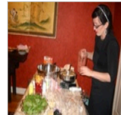
Local synagogue presents Passover cooking demonstration